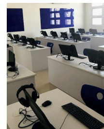
Left: Light, spacious ICT suite with 27 desktop computers

We implemented market-leading, scalable ICT that would cater for usage demand as the school student numbers and management systems increase. This included managing broadband internet suppliers, installing Wi-Fi points, integrating a powerful server and running robust network cables.