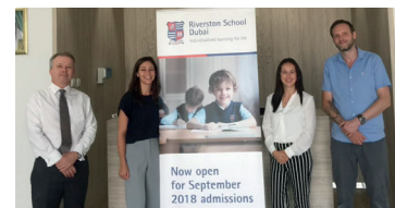
Riverston School Dubai team with SBS Education ICT consultant